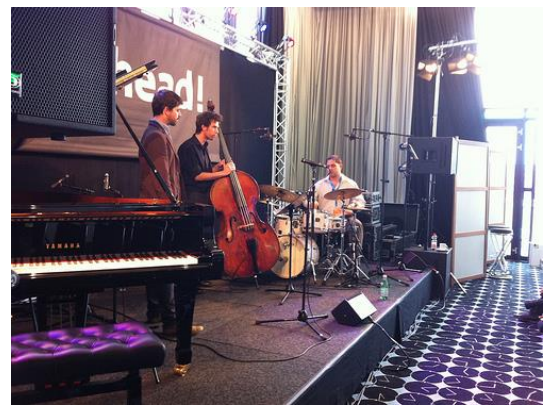
Canadian Blast Showcases @ Jazzahead! 2012