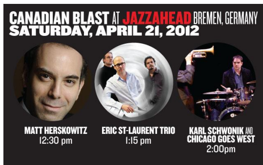
Canadian Blast Showcase lineup, Jazzahead! 2012